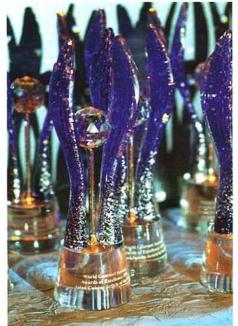
A trophy designed and manufactured by Preciosa.