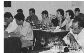
Sentize your senses to wine at the Tutored Wine Tasting Classes