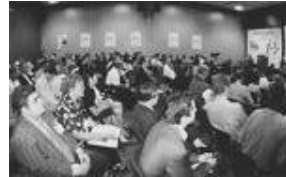
Conference delegates listening intently at the AsiaFruit Congress

To be held on 11 April, a focal point in the BakeryAsia2002 Conference will be a 'live' video conference segment presented by Lesaffre, the world leader in the production of yeast and yeast extracts. Lesaffre will transport participants to their baking centre in France for a real-time demonstration of the advances in baking techniques. These techniques include the preparation of pre-proofed frozen and laminated dough, as well as techniques unique to various country -styled baked goods, for example, Danish pastries, American-styled bagels and French-styled breads.